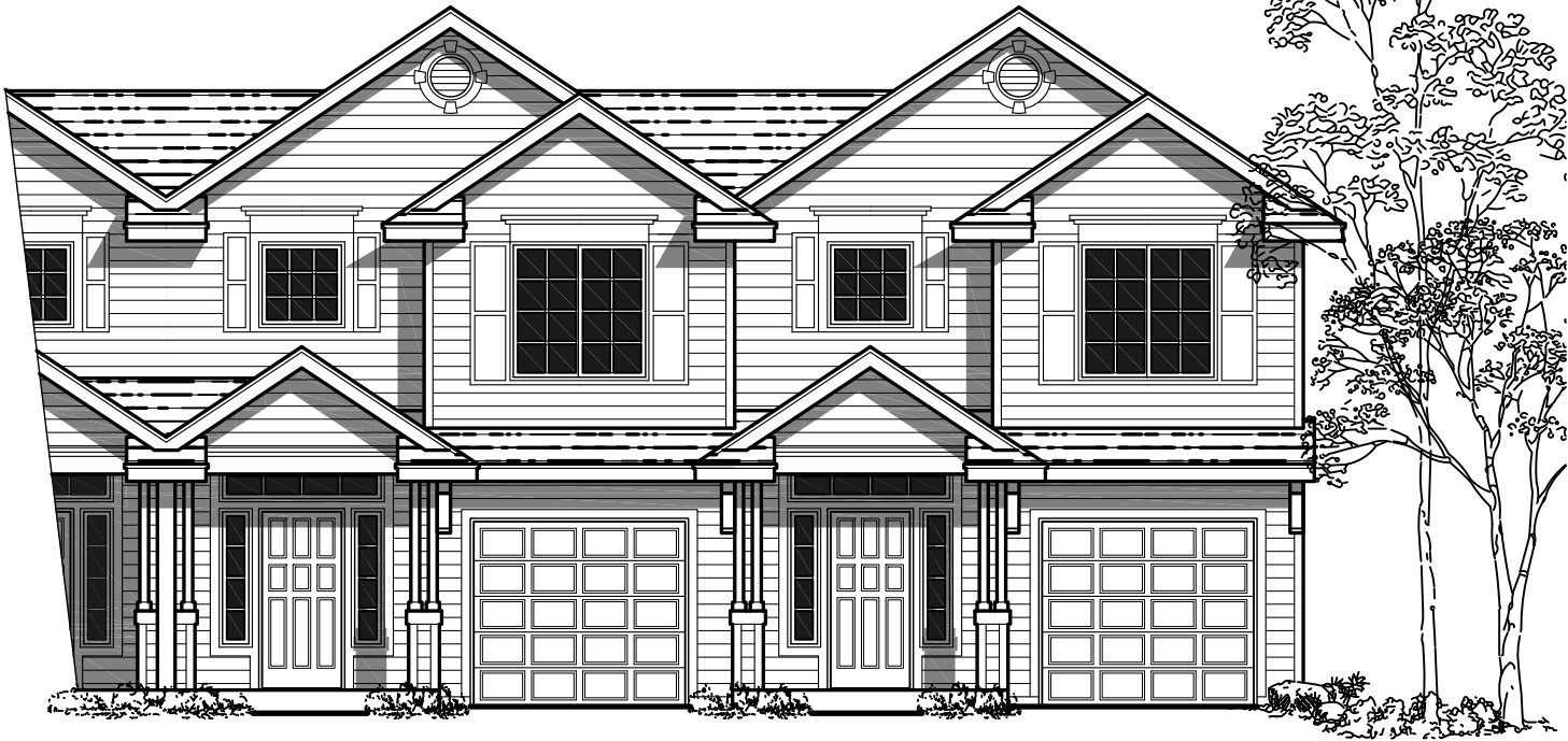
D-467 is 2 units, T-412 is 3 units, F-566 is 4-units