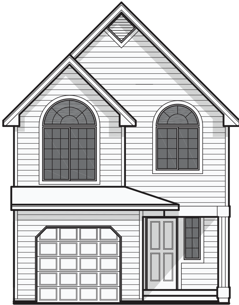
Shown as single family plan 9920

MAIN FLR 490 SQ. FT. UPPER FLR 690 SQ. FT. TOTAL 1180 SQ. FT. GARAGE 230 SQ. FT.