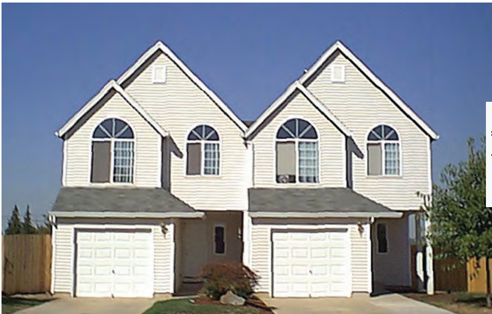
Shown as Duplex plan D-319

Bruinier & associates, inc. building designers 503-246-3022 www.houseplans.pro & www.bruinier.com